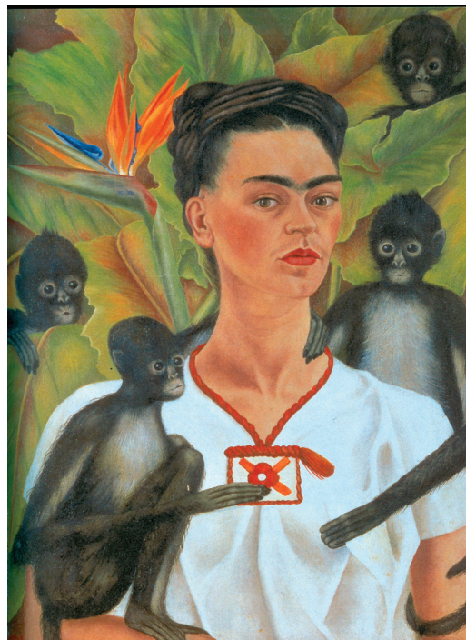
FIGURE 1. FRIDA KAHLO, Self-Portrait with Small Monkey , 1945. Oil on masonite. 22 1/8" x 16 5/8" (56 x 41 cm). Museo Dolores Olmedo, Xochimilco, Mexico City. © 2010 Banco de México Diego Rivera y Frida Kahlo Museums Trust.

Kahlo's works are quite rare — only around 200 oils — and her canonization has spurred an exponen-