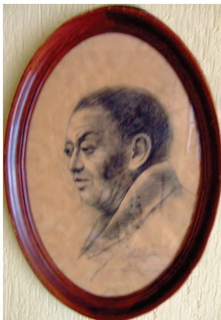
FIGURE 6. Drawing of Diego Rivera . Noyola Collection. Pencil on paper. 19 1/2” x 13 3/4” (50 x 35 cm). The attribution to Frida Kahlo is questioned.

Martin’s theory is that there is a workshop of at least several people that created the archive. “The perpetrators have constructed all these letters, poems, drawings and recipes, using Frida’s biography and her published letters as a roadmap,” she wrote this author before the