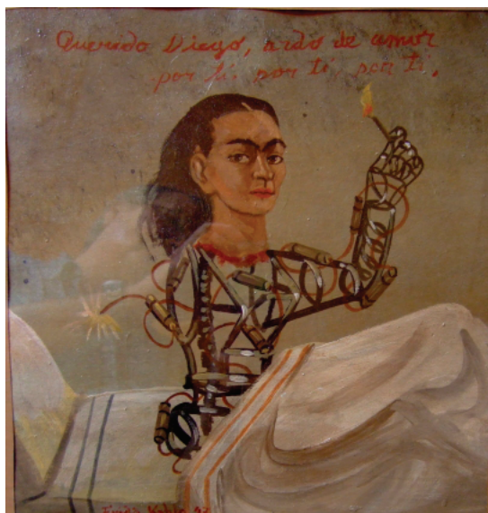
FIGURE 5. Woman with Firecrackers . Oil on cardboard. 35 x 31 cm. Noyola Collection. The attribution to Frida Kahlo is questioned.

Frida-headed deer ( FIG. 4 ) — “is not Kahlo’s painting because the concept of the work as well as its execution were invented by someone who does not understand the depth of her iconography.”