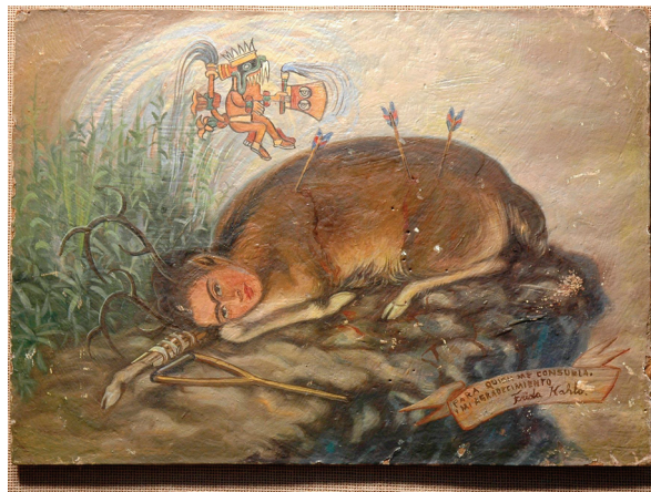
FIGURE 4. The Little Deer . Oil on Masonite. 24 x 33 cm. Noyola Collection. The attribution to Frida Kahlo is questioned.

in recent decades, but nothing quite like the massive cache that emerged last year in Mexico. The “rediscovered” material includes more than 1,200 items — oil paintings, drawings, diaries, letters, painted boxes and ephemera. The owners characterize it as an archive assembled by Frida Kahlo, but the entire collection has been roundly rejected by the established authorities on the artist’s life and work, although other people have spoken out in favor.