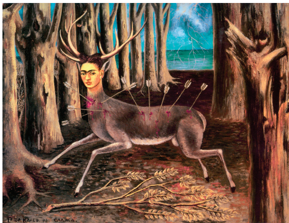
FIGURE 2. FRIDA KAHLO, The Little Deer , 1946. Oil on masonite. 8 7/8" x 11 3/4" (22.5 x 29.8 cm). Private collection. © 2010 Banco de México Diego Rivera y Frida Kahlo Museums Trust.