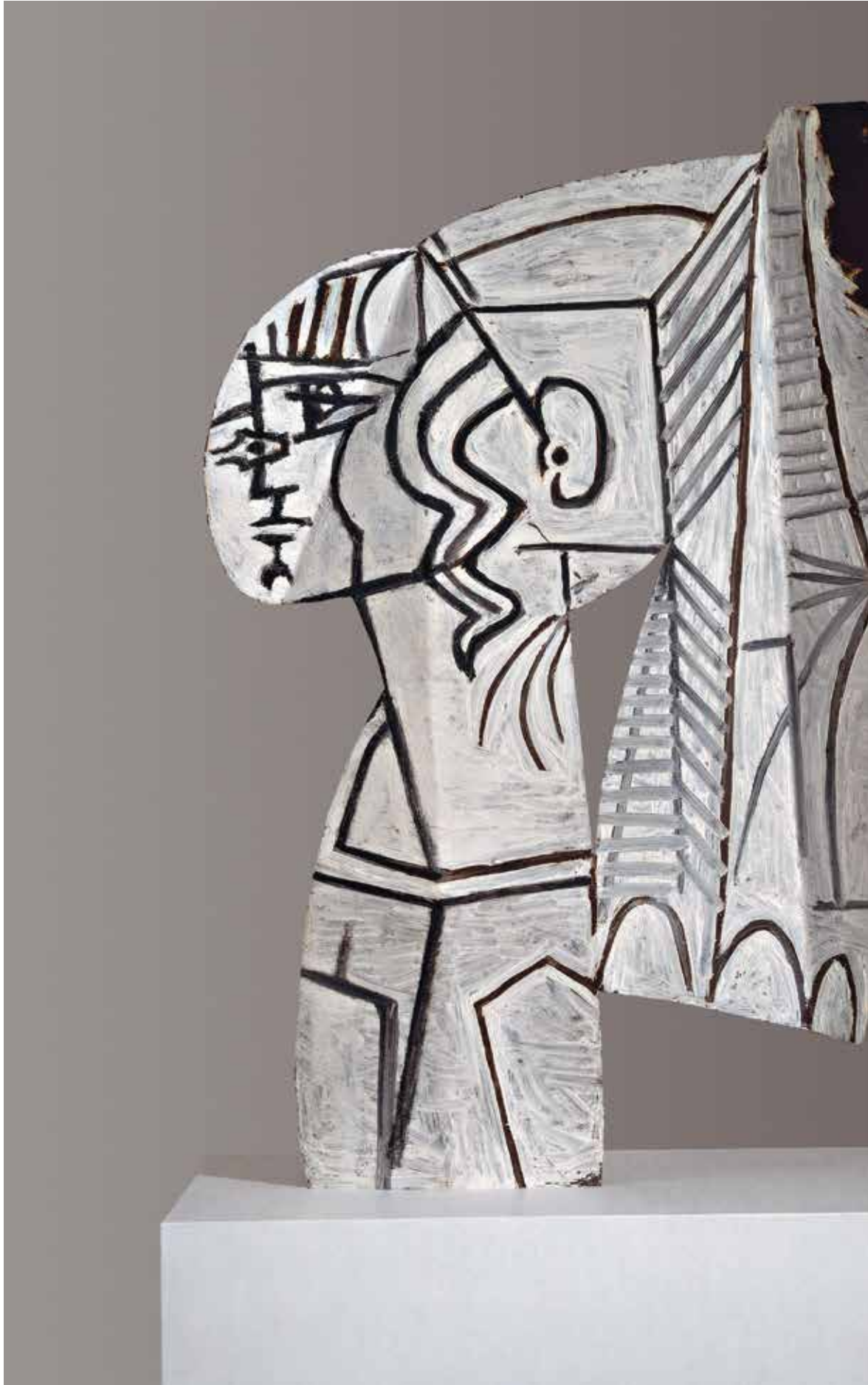
Courtesy Images From Left: Philadelphia MoA/Hall-Merrick; Munch Museum; Courtauld Gallery/Sam Francis Foundation, California/DACS 2021; Mohamed El-Shahed/AFP via Getty Images. Opposite, Images From Left: Courtesy Kunsthaus Zurich; Succession Picasso/2021 ProLitteris, Zurich; John Chamberlain/2021 ProLitteris, Zurich

A billion-dollar, state-of-the-art mega-museum will open on the edge of Cairo, about a mile from the Giza pyramids and a short drive from the new Sphinx International Airport. Billed as the largest archaeological museum in the world, the alabaster façade of the trapezoidal slab extends more than .3 miles long, clearly intended to evoke the monumentality of the pyramids themselves. The interior space measures on par with a major airport terminal and houses a 39-foot granite sculpture of Ramses II, presiding over the atrium where a grand staircase lined with pharaonic statues ascends to a dramatic vista of the actual pyramids. On exhibit are more than 100,000 statues, mummies, papyri, regal paraphernalia, and other objects gathered from museums across Egypt. The greatest treasure is the tomb of King Tutankhamun, a cache of 4,549 personal items that includes his gilded chariot and iconic golden funerary mask. Another highlight is the world's oldest surviving boat, a 4,600-year-old cedar ship unearthed near the Pyramid of Khufu. grandegyptianmuseum.org