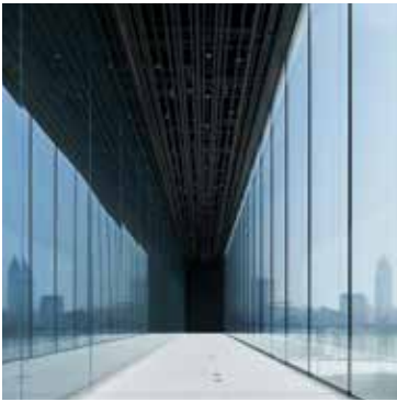
MUSEUM OF ART PUDONG Shanghai Architecture: Jean Nouvel Opened: July 2021