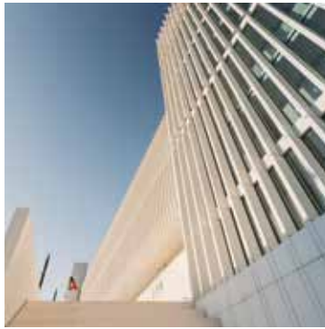
ROYAL TREASURY MUSEUM Lisbon, Portugal Architecture: João Carlos Santos Opens: November 2021

Gas billionaire Leonid Mikhelson has established a new contemporary art center in a decommissioned 1907 power plant overlooking the Moskva River. Piano converted the main building into a cavernous skylighted open-plan venue for performances and installations. Adjoining structures include a former vodka warehouse, house artist residencies, galleries, an auditorium, and eateries. The pristine white-brick complex is the latest addition to Moscow's planned Museum Mile, an urban pathway linking the Garage Museum of Contemporary Art, State Tretyakov Gallery, and Pushkin State Museum of Fine Arts. v-a-c.org