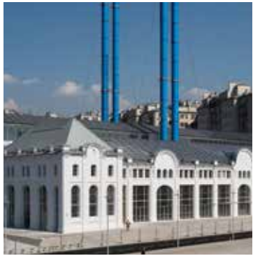
GES-2 ART CENTER Moscow Architecture: Estudio Herreros Opened: October 2021

Gas billionaire Leonid Mikhelson has established a new contemporary art center in a decommissioned 1907 power plant overlooking the Moskva River. Piano converted the main building into a cavernous skylighted open-plan venue for performances and installations. Adjoining structures include a former vodka warehouse, house artist residencies, galleries, an auditorium, and eateries. The pristine white-brick complex is the latest addition to Moscow's planned Museum Mile, an urban pathway linking the Garage Museum of Contemporary Art, State Tretyakov Gallery, and Pushkin State Museum of Fine Arts. v-a-c.org