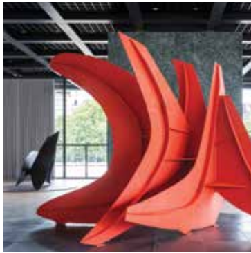
NEUE NATIONAL GALERIE Berlin Architecture: David Chipperfield Architects Reopened: August 2021

Portugal's last royal residence, the never-completed neoclassical Ajuda National Palace, has added a modern wing to house the crown jewels of the former monarchy. More than 1,000 items in gold and diamonds represent Portugal's erstwhile monopolies in Brazil, encompassing the Braganza crown jewels, honorary orders and ritual objects of the monarchy, diplomatic gifts, liturgical objects, and royal coins and medals. The project was partly funded by an insurance payout for jewels stolen while on display in the Netherlands in 2002, and considering the $1 billion heist from Dresden's Green Vault in 2019, where diamonds are concerned, there is no such thing as too much security. palacioajuda.gov.pt