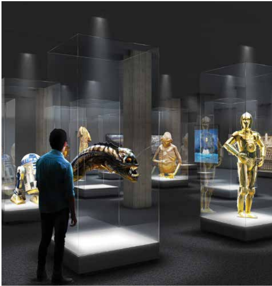
ACADEMY MUSEUM OF MOTION PICTURES Los Angeles Architecture: Renzo Piano Opened: September 2021